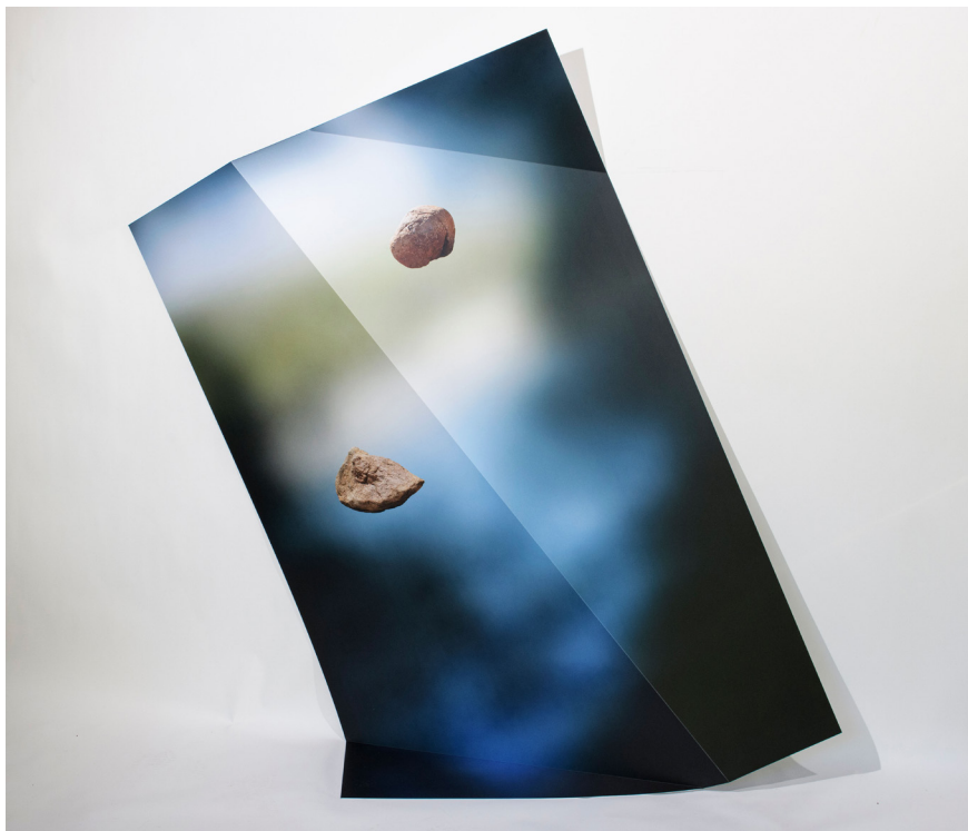
Marian Drew Your body is heavy , 2023 Dye-sublimation on aluminium 175 x 155 x 36cm, Edition 3

Edition 1 of 3 Edition 2 of 3 Edition 3 of 3