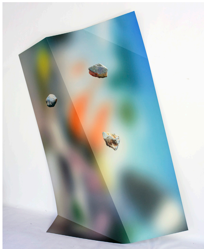
Marian Drew Everything was more vivid , 2023 Dye-sublimation on aluminium 190 x 120 x 32cm, Edition 3

Edition 1 of 3 Edition 2 of 3 Edition 3 of 3