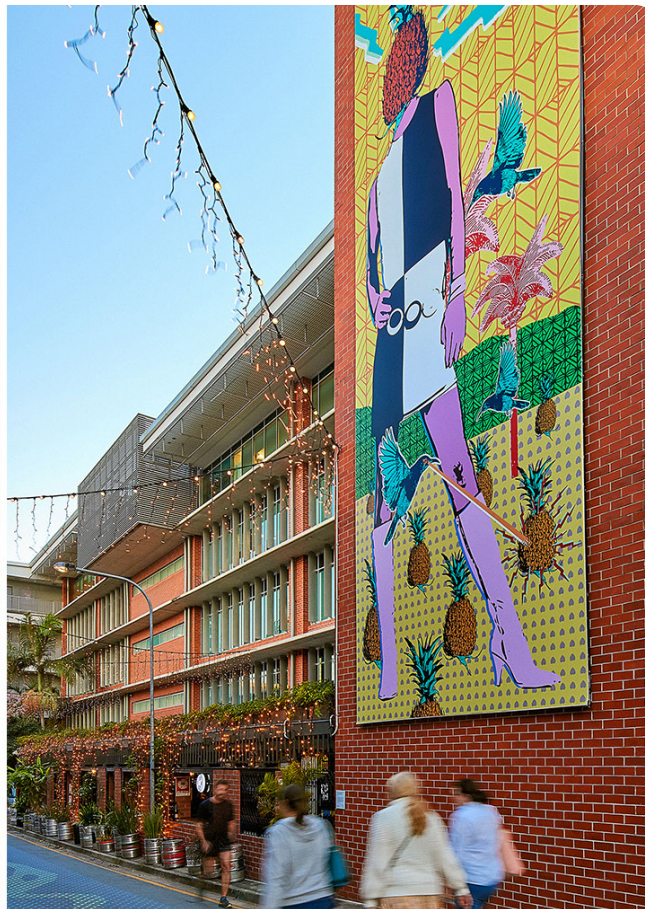
Image courtesy: the artists and Nuit Blanche. Photo: Patrick Leung.