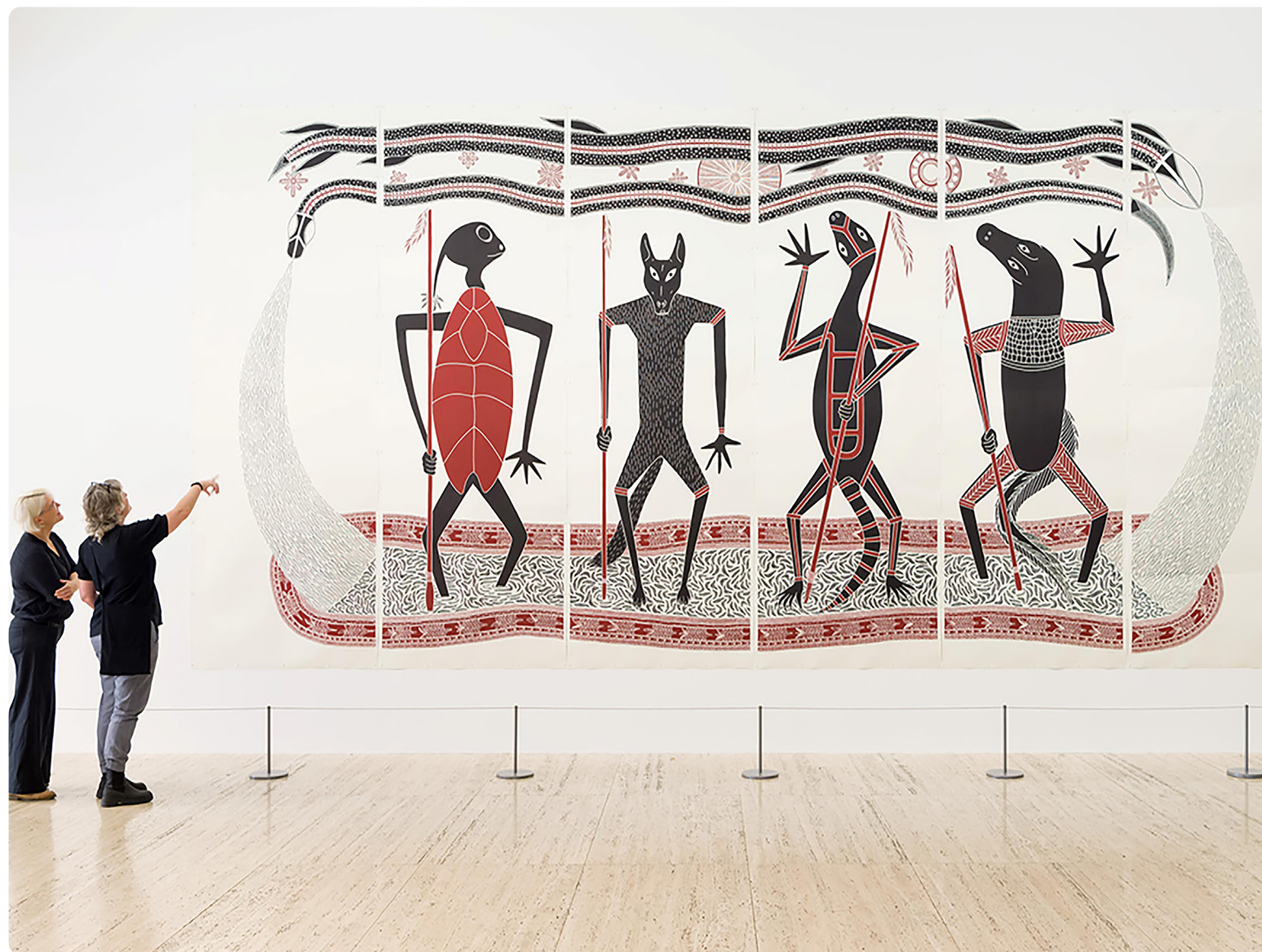
Teho Ropeyarn, Angkamuthi/Yadhaykana peoples, Australia b.1988 / Athumu paypa adthinhuunamu (my birth certificate) 2022 / Vinyl-cut print on velin cuve 350gsm / 284.5 x 489cm / Proposed for the Queensland Art Gallery | Gallery of Modern Art Collection / © Teho Ropeyarn/Copyright Agency