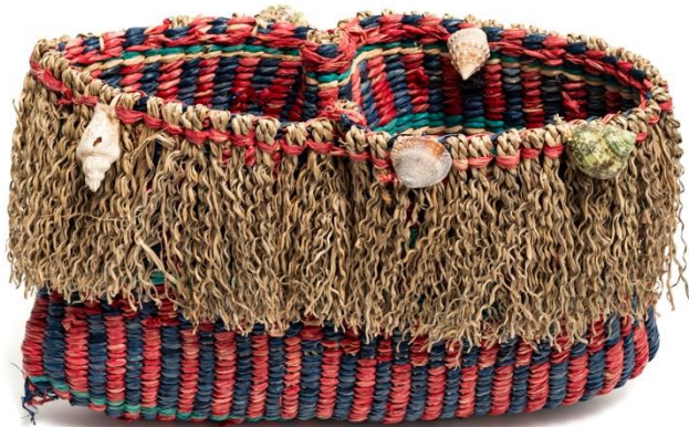
Paula Savage Basket 1, 2026

Woven basket, raffia, seagrass chord, shells 27 x 45cm