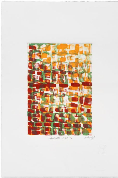
Paula Savage TANDOO EM V , 2026

Monotype screen print on BFK Rives paper. Image: 30 x 21cm | Paper: 57 x 38cm