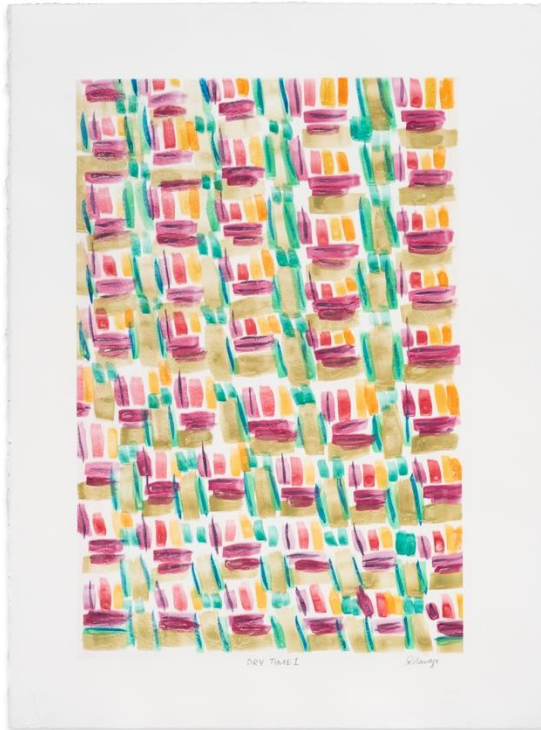
Paula Savage DRY TIME 1, 2026

Monotype screen print on BFK Rives paper. Image: 42 x 30cm | Paper: 76 x 57cm