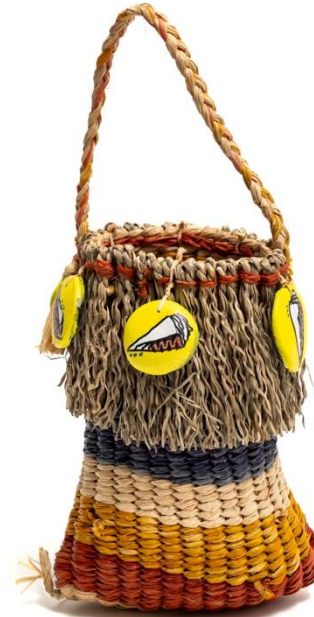
Paula Savage Cone Shell Basket, 2026 Woven basket, raffia, seagrass chord, painted seed pods, 23 x 11cm