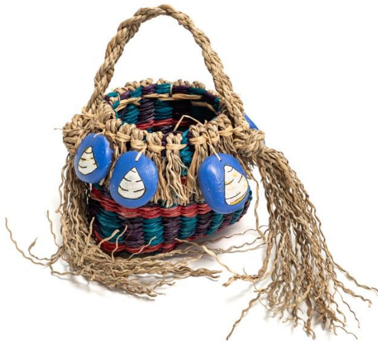
Paula Savage Kabar Shell Basket, 2026 Woven basket, raffia, seagrass chord, painted seed pods, 15 x 12cm