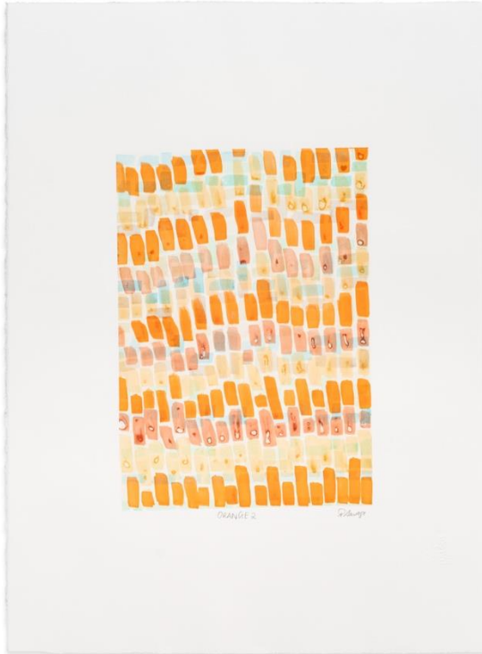
Paula Savage ORANGE 2, 2026

Monotype screen print on BFK Rives paper. Image: 42 x 30cm | Paper: 76 x 57cm