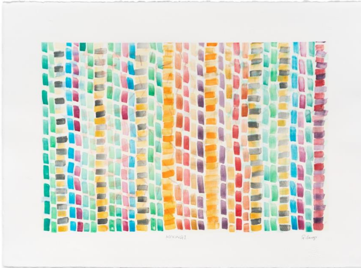
Paula Savage MIXING 1, 2026

Monotype screen print on BFK Rives paper. Image: 40 x 60cm | Paper: 76 x 57cm