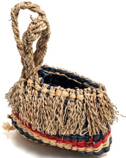
Paula Savage Migi Basket 1, 2026

Woven basket, raffia, seagrass chord, 20 x 12cm