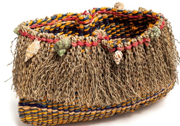
Paula Savage Basket 2, 2026