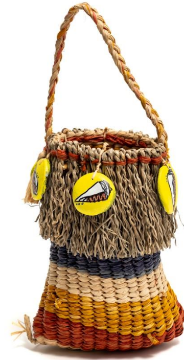
Paula Savage, Cone Shell Basket , 2026. Woven basket, raffia, seagrass chord, painted seed pods, 23 x 11cm.