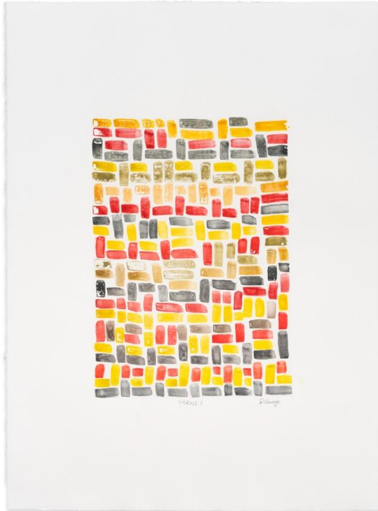
Paula Savage YARNS 1, 2026

Monotype screen print on BFK Rives paper. Image: 42 x 30cm | Paper: 76 x 57cm