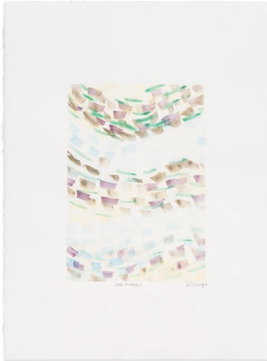
Paula Savage SIDE WARDS, 2026

Monotype screen print on BFK Rives paper. Image: 42 x 30cm | Paper: 76 x 57cm