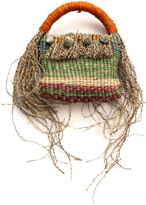
Paula Savage Basket 4, 2026

Woven basket, raffia, seagrass chord, painted seed pods, 30 x 22cm