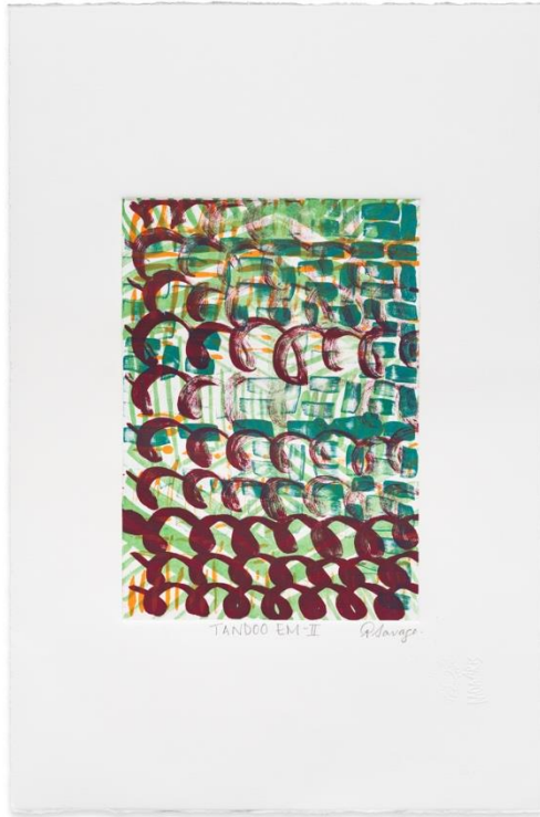
Paula Savage TANDOO EM II , 2026

Monotype screen print on BFK Rives paper. Image: 30 x 21cm | Paper: 57 x 38cm