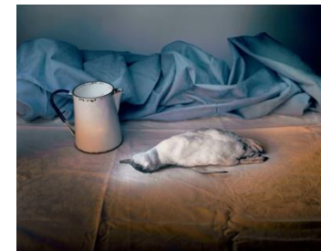
Penguin with Enamel Jug, 2009