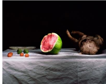
Wombat with Watermelon and Plate, 2005