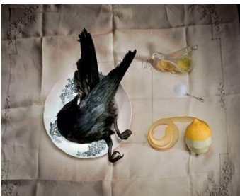
Crow with Salt, 2003