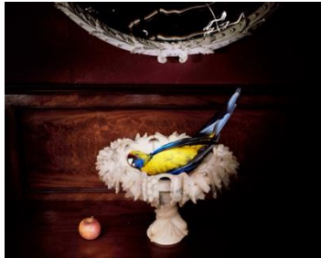
Rosella in Alabaster Bowl, 2005