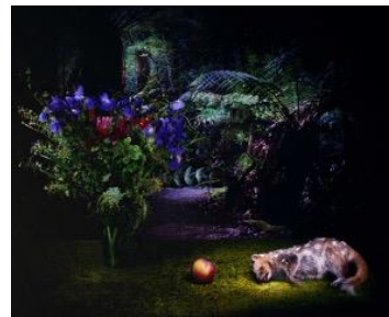
Quoll with Apple and Flowers, 2005