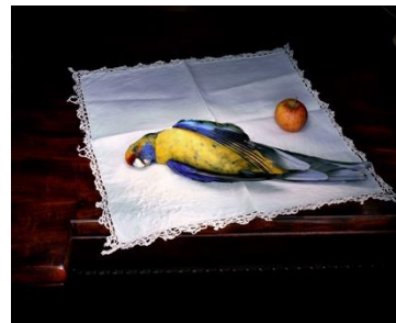
Tasmanian Rosella with Apple, 2005