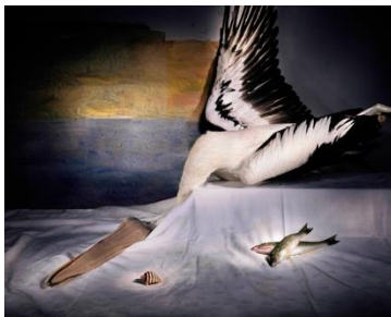
Pelican with 2 Fish, 2003