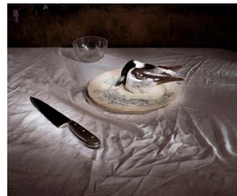
Butcher with Knife, 2003