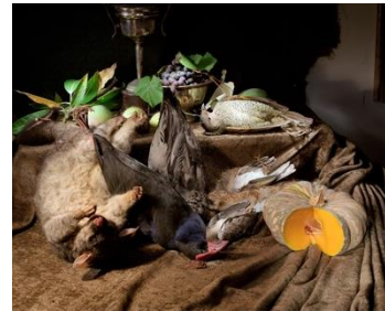
Possum with Five Birds, 2003