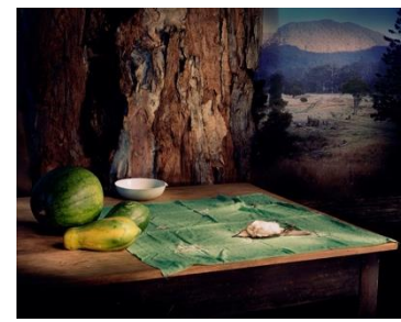
Bird with Trunk and Paw Paw 2005