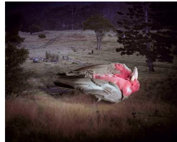
Galah in Landscape, 2003