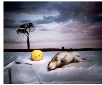
Bandicoot and Quince, 2005