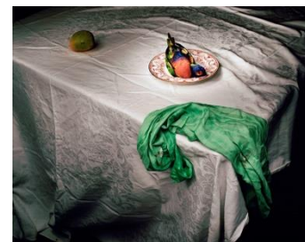
Lorikeet with Green Cloth, 2006