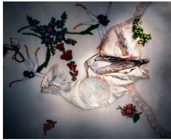
Crested Wood Pigeon with Mother of Pearl Plate, 2010