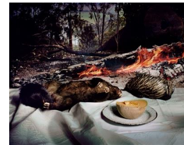
Brush-tail Possum and Echidna with Burning Log, 2006