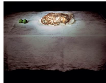
Boobook Owl with Limes, 2006