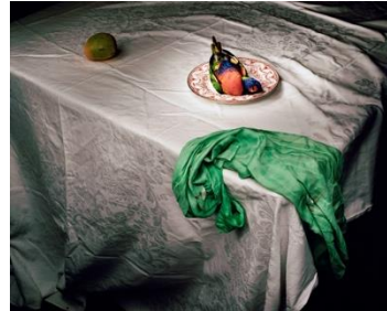
Lorikeet with Green Cloth, 2006