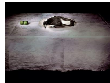
Magpie with Limes, 2006