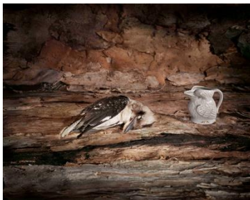
Kookaburra with Small Jug, 2006