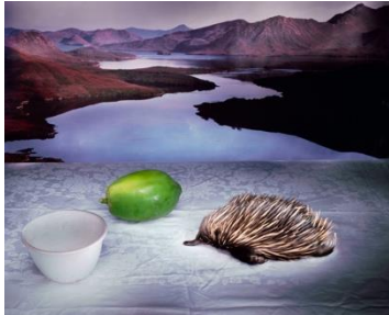
Echidna with Bowl, 2008