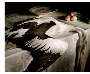
Pelican with Turnips, 2005