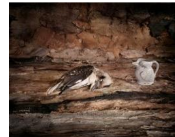
Kookaburra with Small Jug, 2006