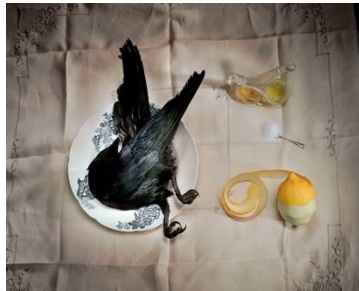
Crow with Salt, 2003