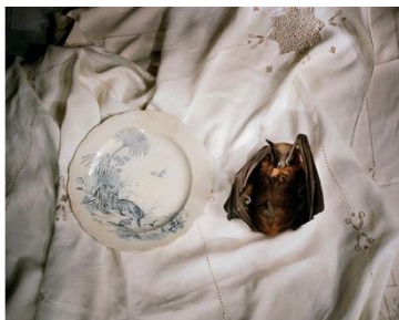
Fruit Bat with Plate, 2003