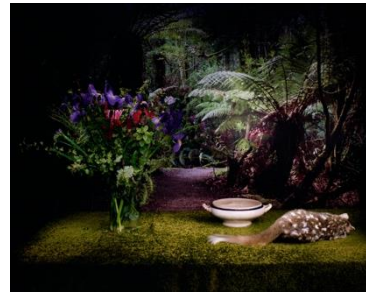
Quoll with Bowl and Flowers, 2005