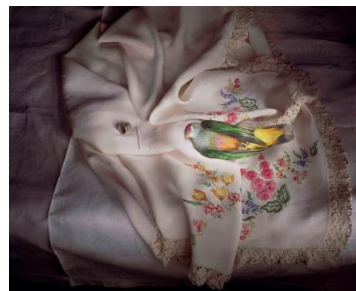
Rose Crowned Fruit Dove on Embroidered Cloth, 2009