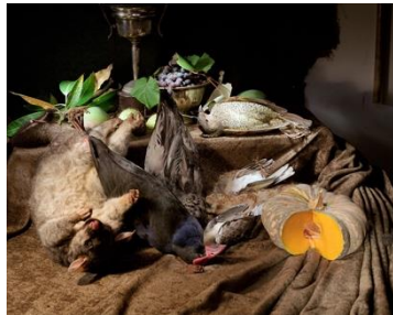
Possum with Five Birds, 2003