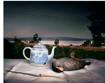
Dusky Moorhen with Enamel Teapot, 2006