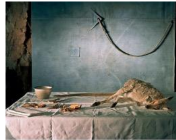
Wallaby with Tarp, 2006