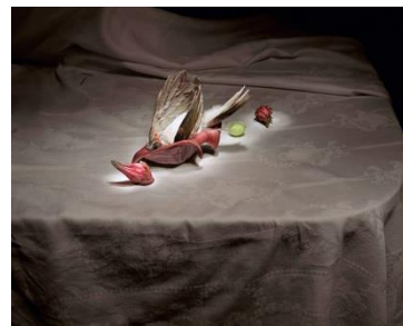
Noisy Minor in Banana Flower, 2003