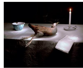
Tasmanian Swamp Hen with Candle, 2005