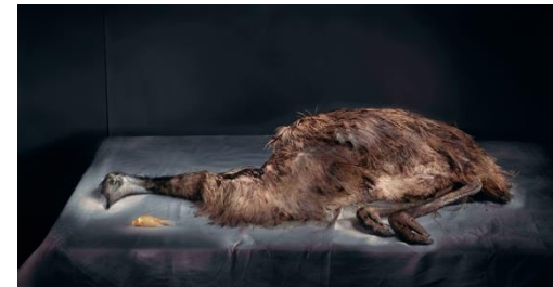
Emu with Yellow Canary, 2009