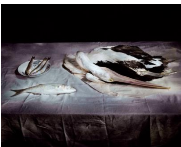
Pelican on Paper and Linen, 2003