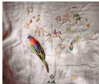
Rainbow Lorikeet on Queensland Needlepoint, 2009