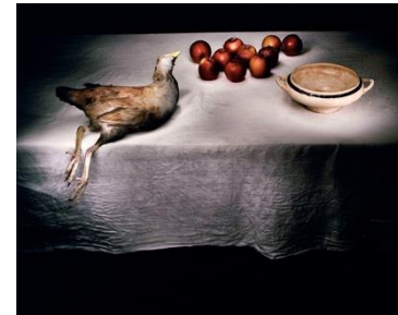
Tasmanian Swamp Hen with Apples, 2005