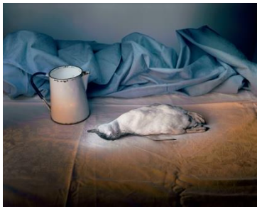
Penguin with Enamel Jug, 2009