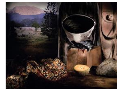
Raven, Rock and Rockmelon, 2003