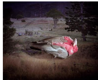
Gallah in Landscape, 2003