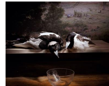
Magpie with Butcher and Bowl, 2003