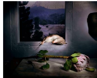
Potoroo with Protea, 2004