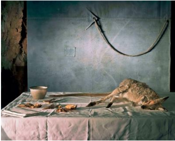
Wallaby with Tarp, 2006