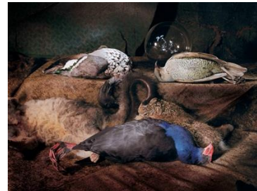
Bower Bird, Swamp Hen, Duck, 2003