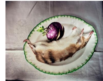
Bandicoot on Plate, 2005