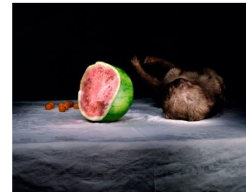
Wombat with Watermelon, 2005