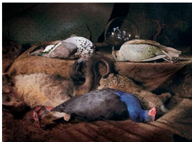
Bower Bird, Swamp Hen, Duck, 2003