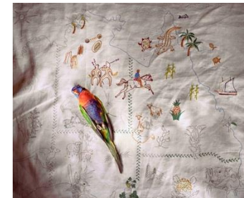
Rainbow Lorikeet on Queensland Needlepoint, 2009