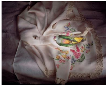
Rose Crowned Fruit Dove on Embroidered Cloth, 2009