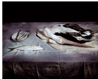
Pelican on paper and Linen, 2003