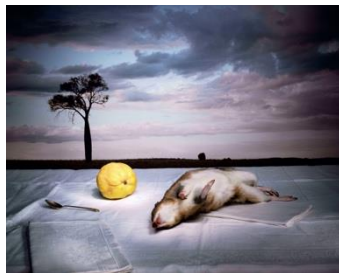
Bandicoot and Quince, 2005