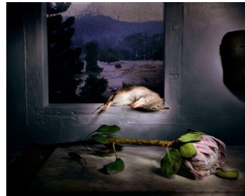
Potoroo with Protea, 2004