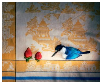
Kingfisher with Two Strawberries on Chinese Cloth, 2009