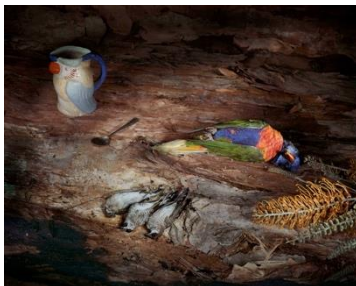
Lorikeet with Jug and 3 Birds, 2006