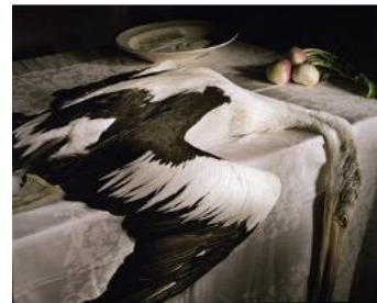
Pelican with Turnips, 2005