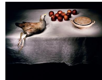
Tasmanian Swamp Hen with Apple, 2005