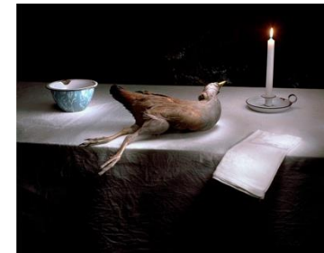
Tasmanian Swamp Hen with Candle, 2005