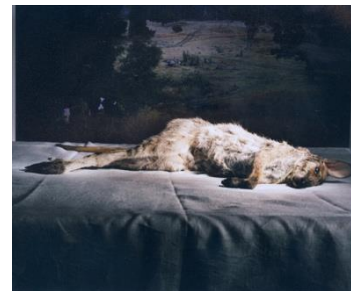
Table Laid Kangaroo, 2004