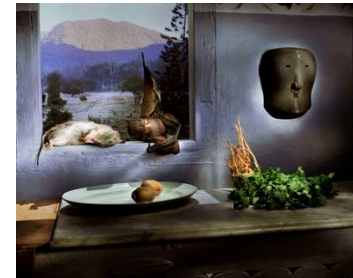
Kitchen View with Mask, 2003