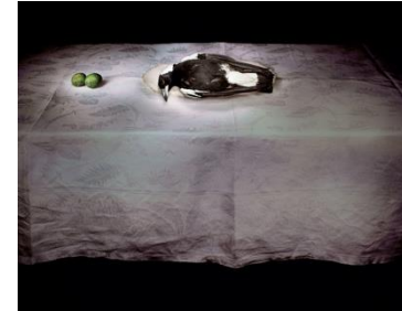
Magpie with Limes, 2006