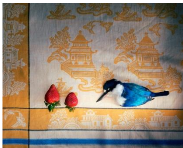
Kingfisher with Two Strawberries on Chinese Cloth, 2009