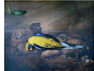
Tasmanian Rosella with Merino Sheep Painting, 2005