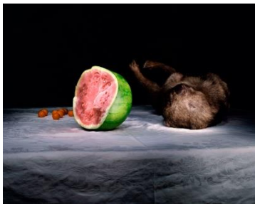
Wombat with Watermelon, 2005