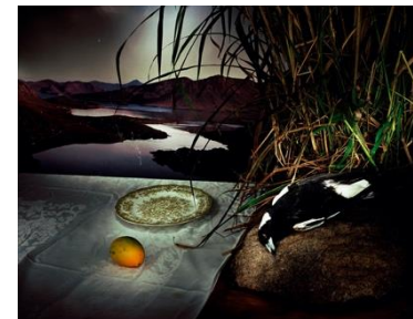
Magpie with Pawpaw, 2006