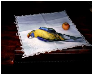
Tasmanian Rosella with Apple, 2005