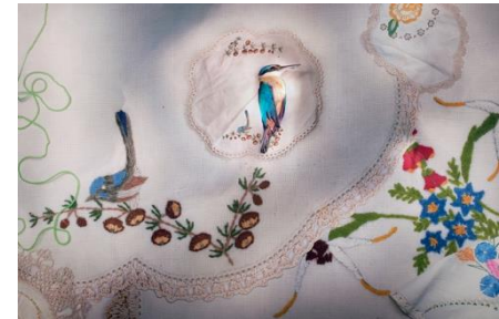
Sacred Kingfisher with Sewn Cloth, 2010