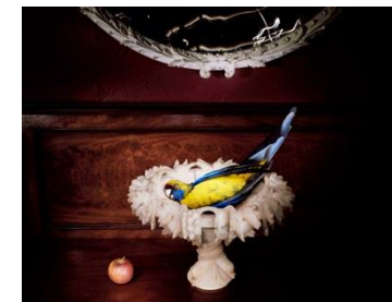
Rosella in Alabaster Bowl, 2005